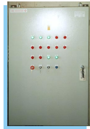
AFR5 enclosure monitors deceleration Braking system is at turn-key solution