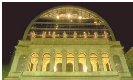
Opéra de Lyon (France) 4xSH18