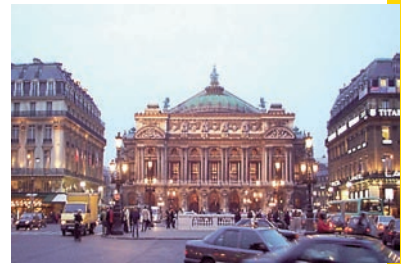
Opéra Garnier (Paris) 26xTHC9

Each THC9 electro-hydraulic caliper may provide up to 70 kN.m of braking torque ; Bastille opera's hoistings are safe for the years to come.