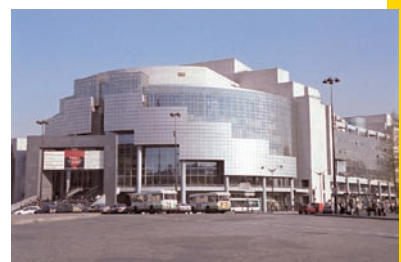
Opera Bastille (Paris) 4xTHC9, 2xSH10, 4x650 calipers