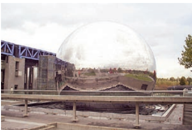
La Géode (Paris) 8x4W calipers