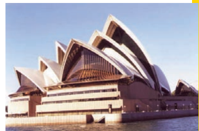
Sydney Opera House 4x650 calipers